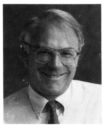
B. C. Gates is a professor in the Department of Chemical Engineering and Materials Science at the University of California at Davis, which he joined after being on the faculty of the University of Delaware for more than 20 years. Gates's research group is active in synthesis, physical characterization, and performance investigations of catalysts including supported metals and metal clusters, zeolites, and solid superacids. Gates is an editor of Advances in Catalysis .

The average metal particle size is usually determined on the basis of the dispersion (fraction of metal atoms exposed) measured by titration of the metal surface sites by hydrogen or CO chemisorption.<sup>5</sup> Complementary measurements are made with transmission electron microscopy and extended X-ray absorption fine structure (EXAFS) spectroscopy.<sup>3</sup> With dispersion data, it is possible to determine the rate of a catalytic reaction per exposed surface metal atom, referred to as a turnover frequency or a turnover rate.<sup>4,5</sup>