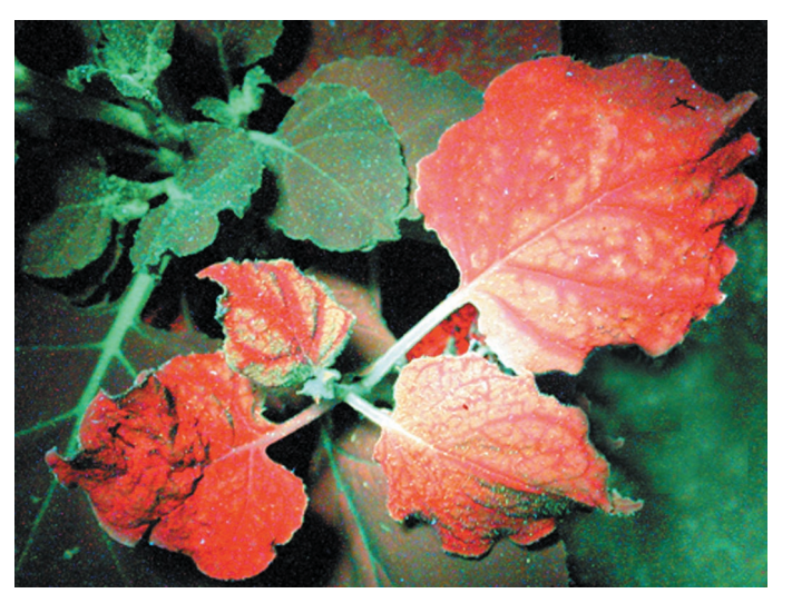
Fig. 1. RNA silencing on the move. Movement of the mobile silencing signal in a GFP-expressing tobacco plant is visualized as a red trail where GFP has been silenced, revealing red fluorescence of chlorophyll in the background of green fluorescence from GFP.

In our model, silencing mediated by dsRNA and by viral RNA are separate branches of the pathway that merge with the sense transgenesilencing branch at the step of dsRNA accumulation. Evidence for these separate branches of the pathway comes from studies of the effect of dsRNA continuously produced by a transgene or delivered exogenously by a virus into silencing-defective mutants of Arabidopsis. VIGS occurs in Arabidopsis RdRP (sgs2/ sde1) and RNA helicase (sde3) mutants impaired in silencing of a sense transgene (22, 26). Similarly, silencing mediated by transgenes producing dsRNA occurs in RdRP (sgs2/sde1), coiled-coil (sgs3), and PAZ/Piwi (ago1) mutants (45). Studies of RNA silenc-